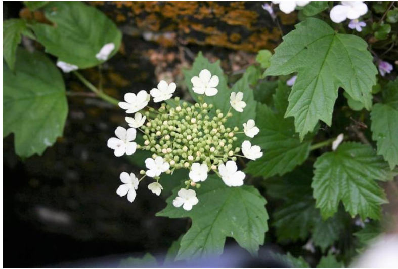
Guelder Rose blossom