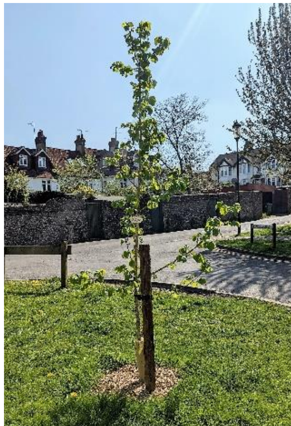
Turkish Hazel, St. Pancras Gardens

In April, we received a donation of eight Turkish Hazel trees, ( Corylus colurna ), to plant as street trees. Working with Chris Bibb, LDC Specialist Adviser for Parks and Open Spaces, we quickly found good places for them all so that we could plant them before the end of the best tree planting period. We placed two in Timberyard Lane, following a request made to us at the Planet Party last September, two in St. Pancras Gardens, and four in Jubilee Gardens. They are all doing very well, and we hope that one day they will look as magnificent as the Turkish Hazel growing outside Waterstone's!