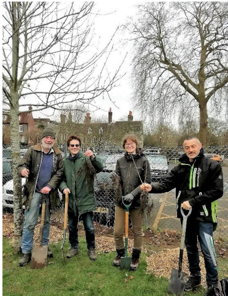
Trees Committee Members

Lewes Urban Arboretum also donated and planted a lovely Field Maple to add to the row of four trees at the edge of the car park.