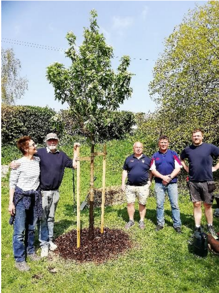
Hybrid Whitebeam at the Stanley Turner Ground

Later in April, we were asked to advise Lewes Rugby Club about planting a memorial tree at the Stanley Turner Ground. They selected a beautiful Hybrid Whitebeam, ( Sorbus thuringiaca Fastigiata ), which we helped them to plant on a lovely Spring morning. It is a cross between a Rowan and a Whitebeam and shows the best features of both trees!