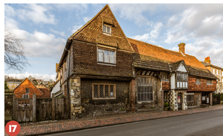
17 Anne of Cleves House (52 Southover High Street) 15th Century timber-framed Wealden hall house, part of Queen Anne's annulment settlement from Henry VIII. Historic interiors and many items of Sussex interest. Open Friday to Sunday, 11am-3pm