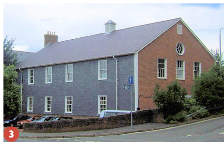
3 Jireh Chapel (Malling Street) Grade I listed chapel dating from 1805, enlarged in 1827, and still in regular use. The simple interior has galleries with corner staircases, plastered vault ceiling, octagonal pulpit and pine box-pews. Open Saturday, 10am-4pm