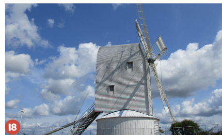
18 Ashcombe Windmill (off map) The 1828 post-mill on Kingston Ridge near Lewes was destroyed in a gale in 1916. This replica of the original completed in 2015 has panoramic views over the South Downs. Tours Saturday 11am and 2.30pm, must book, max 12 people. 30 minutes walk via Juggs Road, see website for details and directions by car

For venues where you need to book, scan the QR code above the map, go to friends-of-lewes.org.uk/hod2023/ or search on the national Heritage Open Days website heritageopendays.org.uk