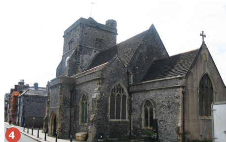
4 St Thomas à Becket Church (Cliffe High Street) Grade II* church, probably founded as a chapel soon after the martyr's death in 1170. 14th century nave arcade and 15th century tower. 1670 clock by Ditchling blacksmith James Looker. Tours Friday and Saturday, 11.30am, must book, max 12 people