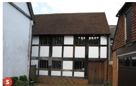
5 Harpsichord Workshop (English Passage, off Cliffe High Street). Late 16th century timber-framed building with crown-post roof, perhaps originally a market hall, rebuilt in 1990 by local architect David Russell. Open Saturday, 10am-4pm