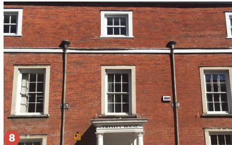
8 Trinity House (213 High Street) 1607/8 timber-framed building with Georgian facade clad in red mathematical tiles. Once the town armoury and home of the local commander during the Civil War. Tours Saturday 10.30am and 2.30pm, must book, max 15 people