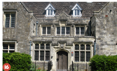
16 Southover Grange (Southover High Street) built in 1572 with Caen stone from the demolished Lewes Priory. 16th century fireplaces, main staircase dating from major restoration of 1871, terrace and garden. Open Friday, 9.30am-midday