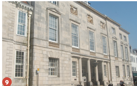
9 Crown Court (High Street) Originally designed as the County Hall in 1812, it has a neo-classical facade in Portland stone with Coad-stone figures representing Wisdom, Justice and Mercy. Panelled 19th century court rooms. Open Saturday, 10am-2pm, security checks