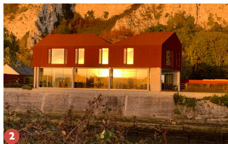
2 The Rusty House (South Street) This award-winning 2015 house designed by Sandy Rendel has featured on Grand Designs. The Corten steel skin, with its warm, naturally reddish-brown colour, references the town's industrial past. Open Sunday, 10am-5pm