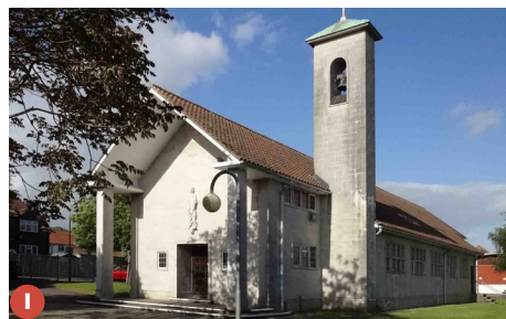
1 Priory School Chapel (Mountfield Road, between Priory School and East Sussex College) War Memorial chapel (1960) by Edward Maufe, designer of Guildford Cathedral and several Sussex churches. Open Saturday, 1pm-5pm. Parking