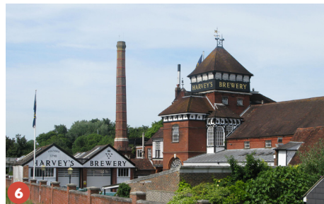
6 Harveys Brewery (off Cliffe High Street) is the oldest independent brewery in Sussex and its distinctive Victorian tower is a local landmark. Tours Friday 6.30pm and Saturday midday, must book, max 25 people, meet near Harveys shop