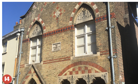
14 Freemasons Hall (149 High Street) Grade II 1868 building still owned by the South Saxon Lodge, one of the oldest in Sussex, built on the remains of the medieval Westgate tower. First floor temple. Open Saturday and Sunday, 10am-4pm