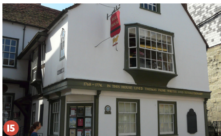
15 Bull House (92 High Street) 15th century timber-framed house, once lived in by Thomas Paine, author of The Rights of Man and a key influence in the American War of Independence. Open Friday to Sunday, 11am-2pm