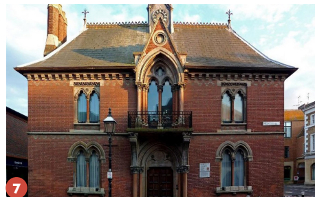
7 Fitzroy House (corner of High Street and Friars Walk) Landmark Victorian Gothic building (1862) by Sir George Gilbert Scott. For many years the town library, it was rescued from demolition in the 1970s. Open Friday and Saturday, 10am-4pm, Sunday, 11am-4pm. Talk on the building, Saturday 7.30pm, Sunday 4pm, must book